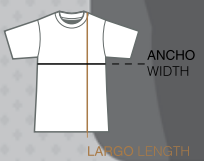
Playeras - Playeras Tipo Polo T-Shirts - Sport Shirts