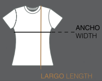
Playeras - Playeras Tipo Polo T-Shirts - Sport Shirts